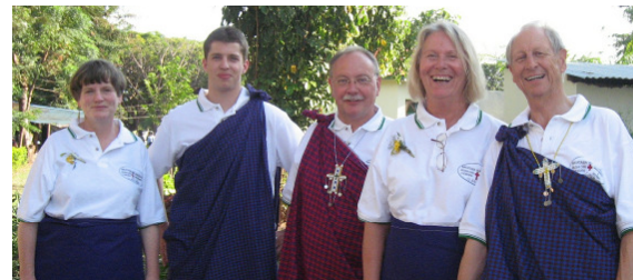
2009 - the delegation in Tanzania