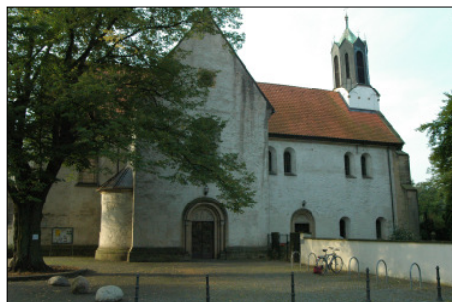
Monastery Church of Marienwerder, built 1196 - 1200

Augustinerweg 21, 30419 Hannover, Germany Tel. +49(0)511/792083; Fax +49(0)511/7920830 www.marienwerder.de gemeindebuerer@marienwerder.de