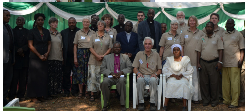
2011 - 40 years together on the way - founders, pioneers, staff members