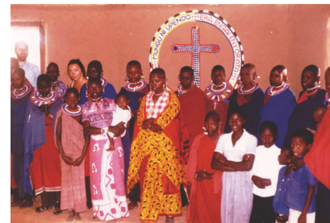
Baptism service in Magadini (1983)