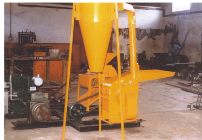
Grinding mill in Arusha, seen in October, 1997