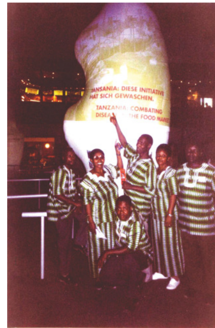
Visiting World Exhibition EXPO 2000 in Hanover the delegation meets Tanzanian initiatives.