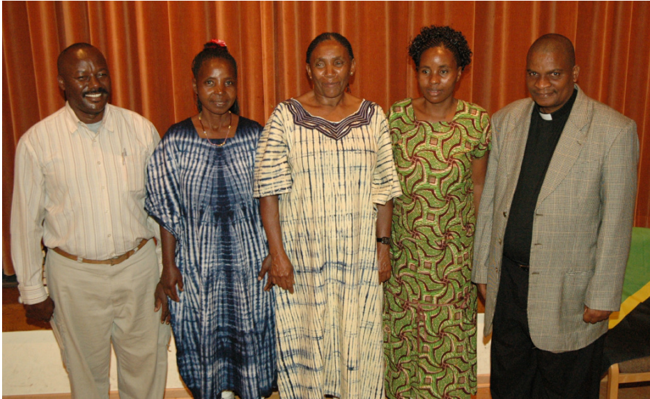
Delegation 2010 in Marienwerder