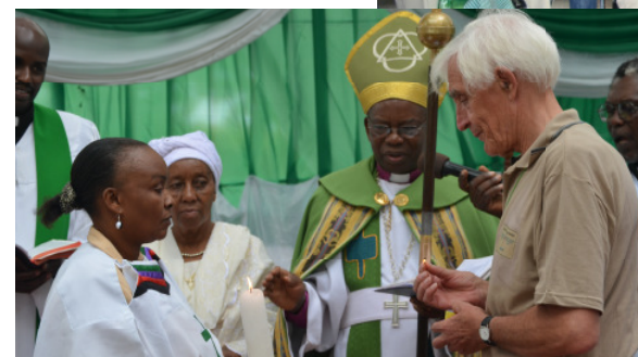
2011 - 40 years partnership - special service in TPC