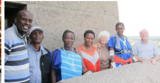
2014 in Leipzig on the memorial „Völkerschlachtsdenkmal“