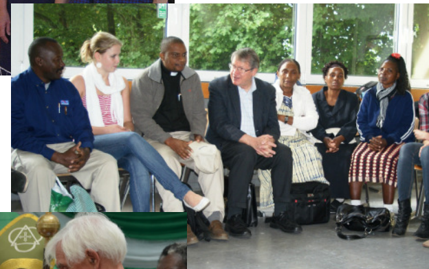
2010 - visit in secondary school „Kepler-Gymnasium“ in Garbsen