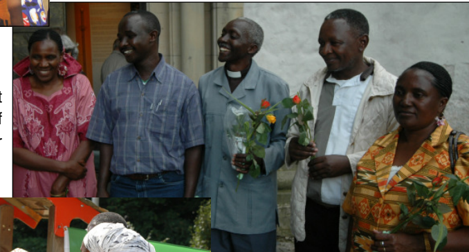
The delegation 2008 in front of monastery Church of Marienwerder

Many baptisms were celebrated during the visit in Tanzania in 2007, mostly in the western and southern villages of Magadini and Msitu wa Tembo.