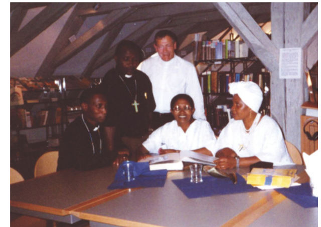
A delegation from Tanzania visits the Bible study and exhibition Center in the monastery of Marienwerder