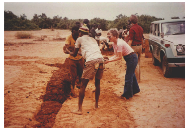
1979: Cooperating in Building a church in Magadini