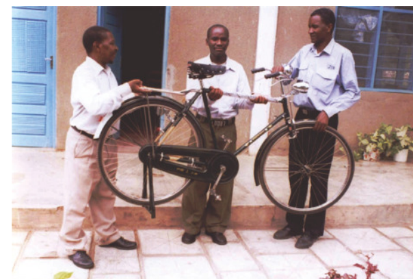
They bring evangelists and the gospel through the country and the villages: Bicycles are needed at any time and everywhere.