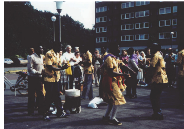
Visitors from the South of Tanzania, 1983, staying as guests in Marienwerder while taking part in the church congress in Hanover in 1983.