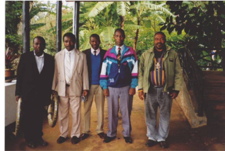
Hotel Capricorn, 1999: The five pastors. The photo was taken on occasion of a co-workers study and recreation excursion.