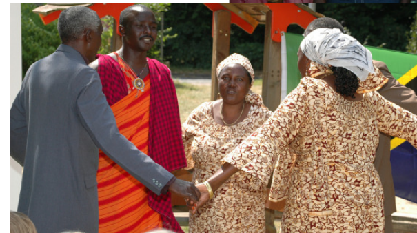
Parish-festival in Marienwerder in 2008 biblical play