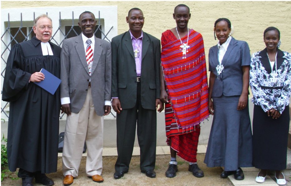
Delegation 2012 in Leipzig