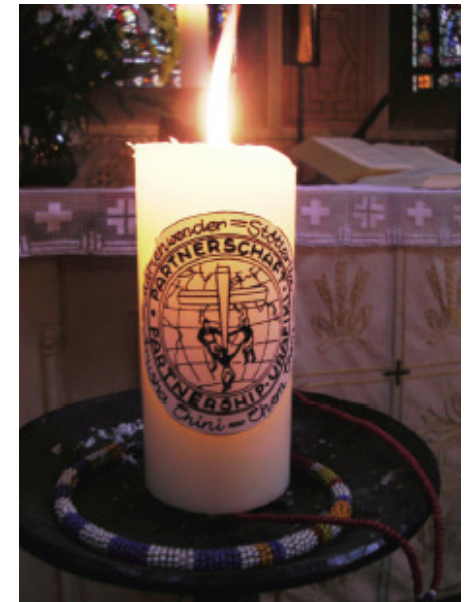
there is prayer in Marienwerder and Stötteritz each Sunday for the partners. The partnership candles are burning during the service. So the partners are present with us.