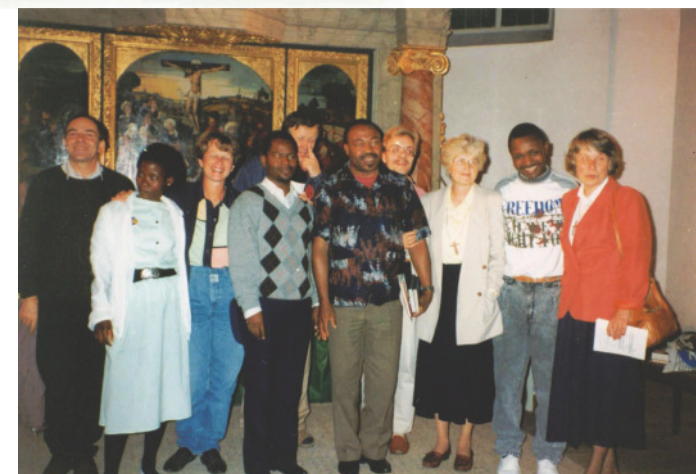
Tanzanian delegation 1993 in St. Mary's church, Stötteritz