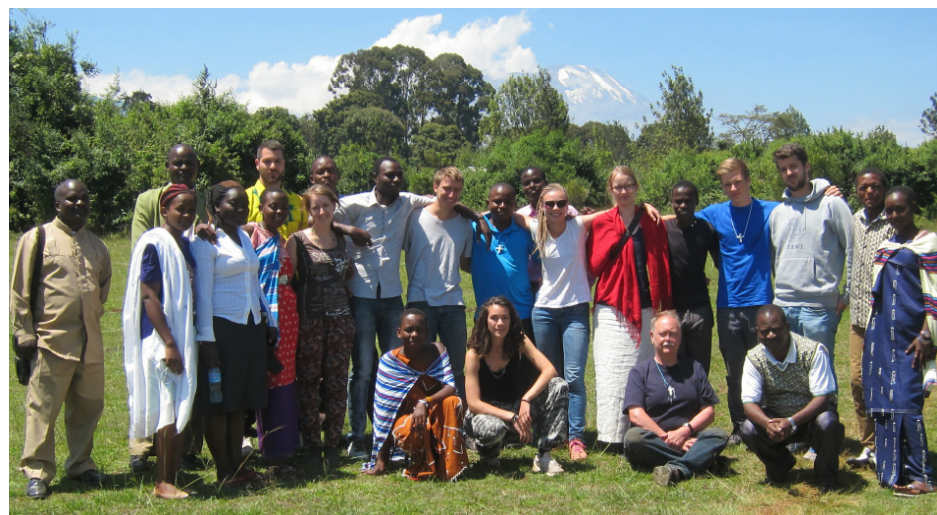
2015 - the attendees of the workcamp in TPC