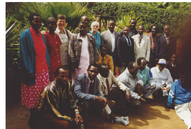
Evangelists and Parish Workers-Backbone of all parish work in the villages, gardeners at the roots!