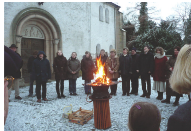
Easter Service in Marienwerder, very early on a winter morning