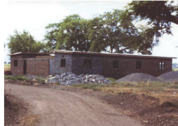
House for evangelists in T.P.C., supported also by Marienwerder and Stötteritz

In April devastating floods follow heavy storms. Marienwerder helps with money and medicine. The Church Building in Korongo is completed and consec-